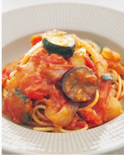
Pasta Vegetable Caponata

Pasta in a rich Genovese sauce with basil, nuts and Gorgonzola cheese.