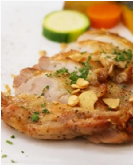
Grilled Chicken Saute Comes with bread or rice

Abita's special curry stewed with spices.