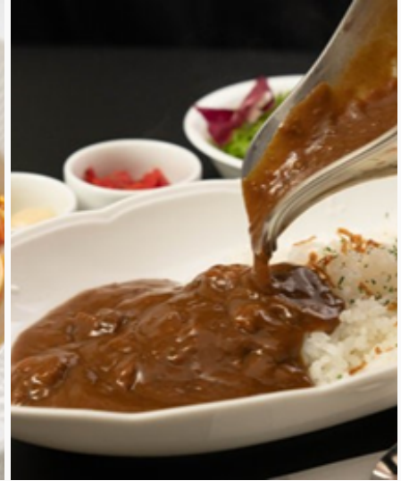
Special Spicy Curry And Rice

Tomato based pasta with a concentrated flavor of seasonal vegetables.