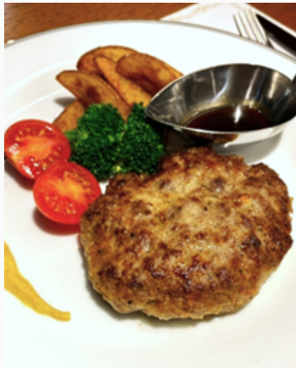
Beef Hamburg Steak Comes with bread or rice

Crispy and juicy grilled chicken served with soy sauce based sauce.